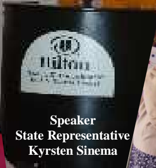
Speaker State Representative Kyrsten Sinema