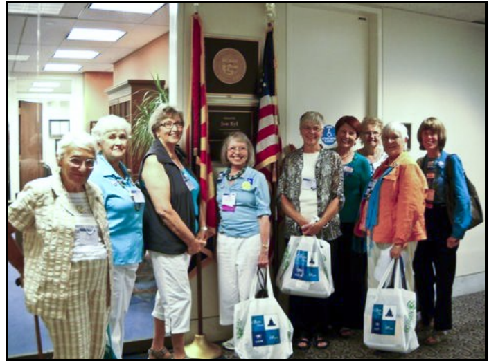
Near John Kyl's office