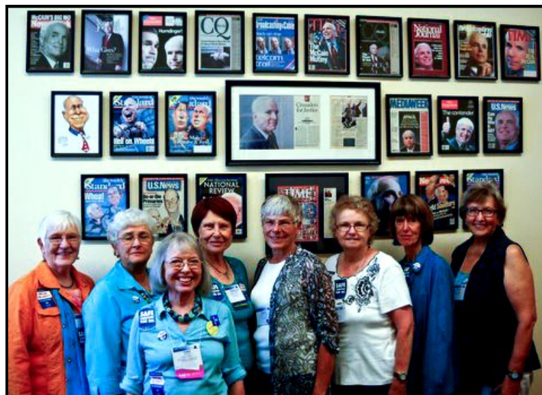
John McCain's Conference Room