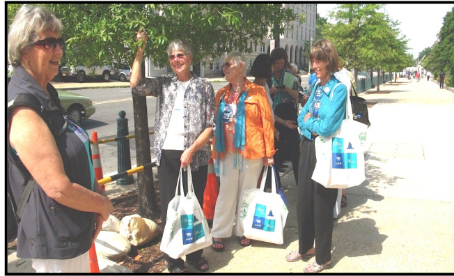
"Finding shade on our way to lobby"

I hope that more branch members can attend future conventions. We need to feel the power of connectedness—and visibility—on occasion. Doing so gives us renewed energy to succeed at home.