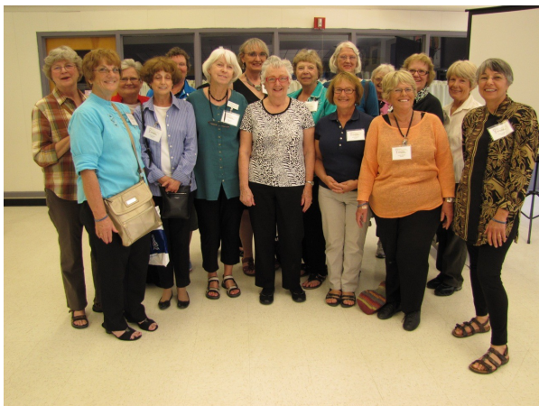
AAUW members helped organize and run the Expanding Your Horizons program with WISE from the University of Arizona.