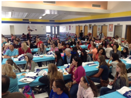
Listening to speakers during the EYH program.