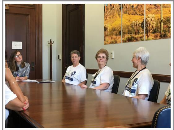
Lobby Day on Thursday, June 15, stood out as a day for focusing on issues and representing AAUW-Arizona.

All of the Public Policy proposals and Resolutions were passed. All but two of the proposed bylaws passed. The two which did not pass were the proposal to change the quorum to 3% and the proposal to add an Advocate category of membership. A two-thirds majority is required to pass bylaws changes. The vote on the Advocate category was Yes - 5728, No - 2913. In order to pass, that proposal would have required 5761 votes, so it failed by only 33 votes out of 8641 total votes.