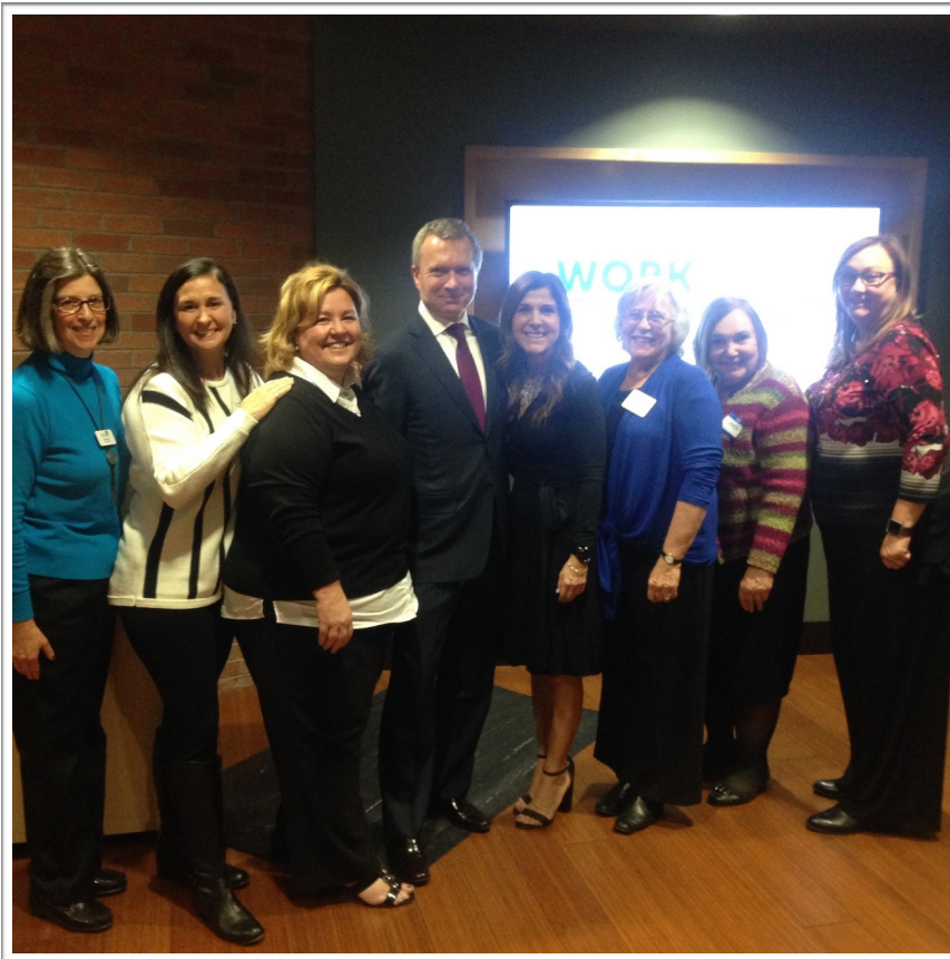
AAUW and City of Tempe equal pay advocates attend launch of City of Tempe Work Smart Workshops on December 2016.