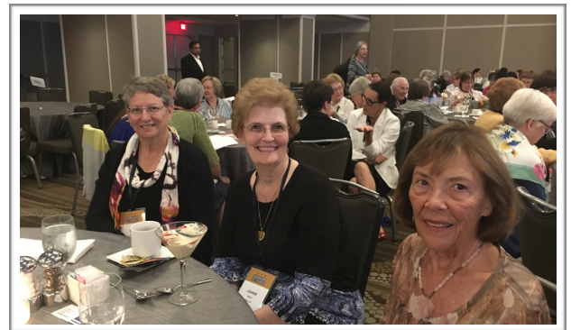
Lunch and dinner keynote speakers were terrific: inspiring and invigorating!