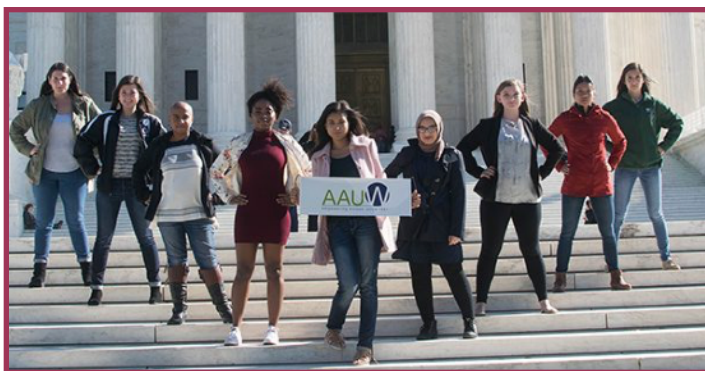
The 2016–17 SAC members outside the Supreme Court during their fall leadership retreat.