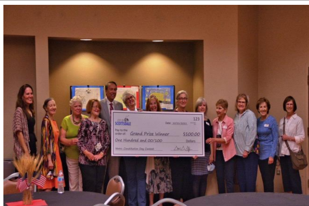
Scottsdale branch members with the award CHECK!