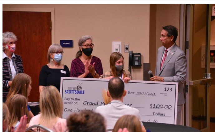
Award winner receives her check!

In December, Scottsdale AAUW is holding our annual Holiday Luncheon to benefit AAUW Funds and local scholarships. This event coincides with the yearly campaign among members to donate to AAUW Funds. It's a fun holiday event, with a silent auction, hostess gifts and a jewelry sale. We invite members from other branches to join us. Click HERE to view the invitation and reserve your seat.