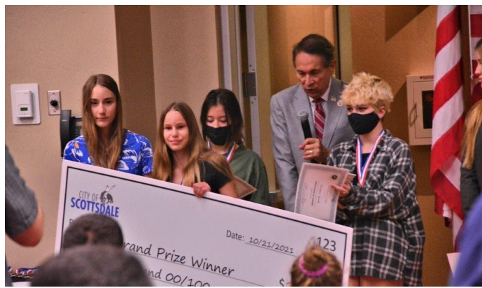
Winning student receives her award – with other finalists & the Mayor.