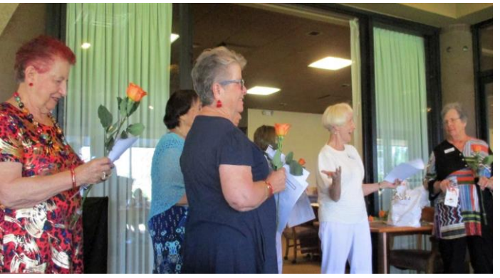
Enjoying recognition and installation of NWV Officers.