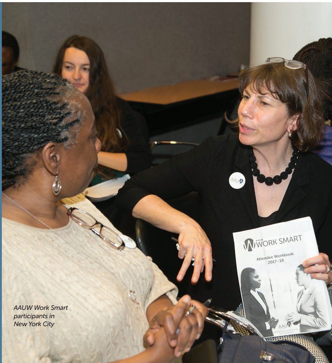
AAUW Work Smart participants in New York City