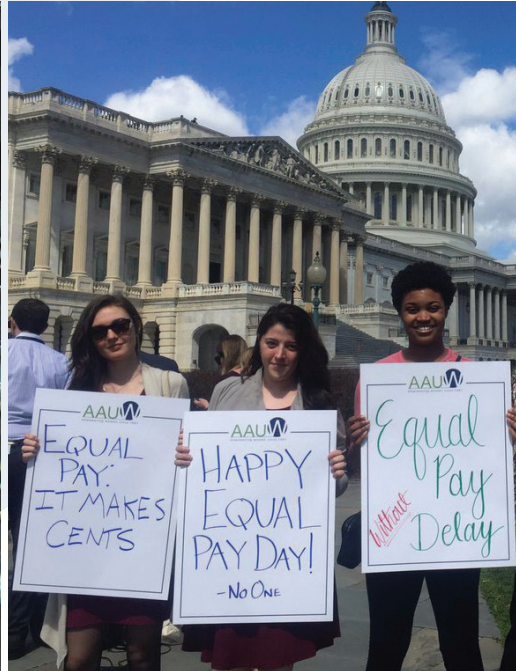
AAUW equal pay advocates on Capitol Hill