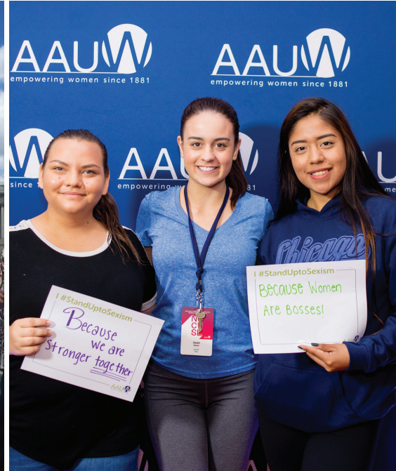
AAUW student leadership conference attendees