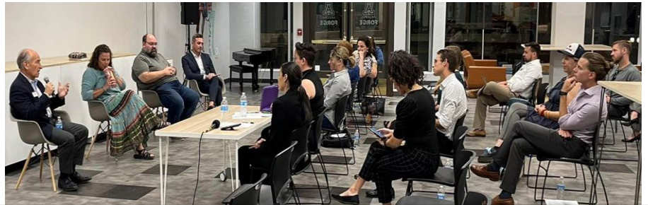
Left: Running and Winning Workshop.