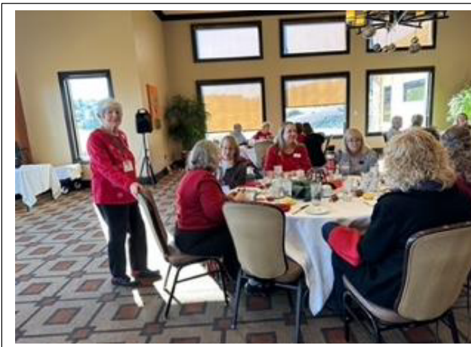
Members enjoying the Holiday Brunch.