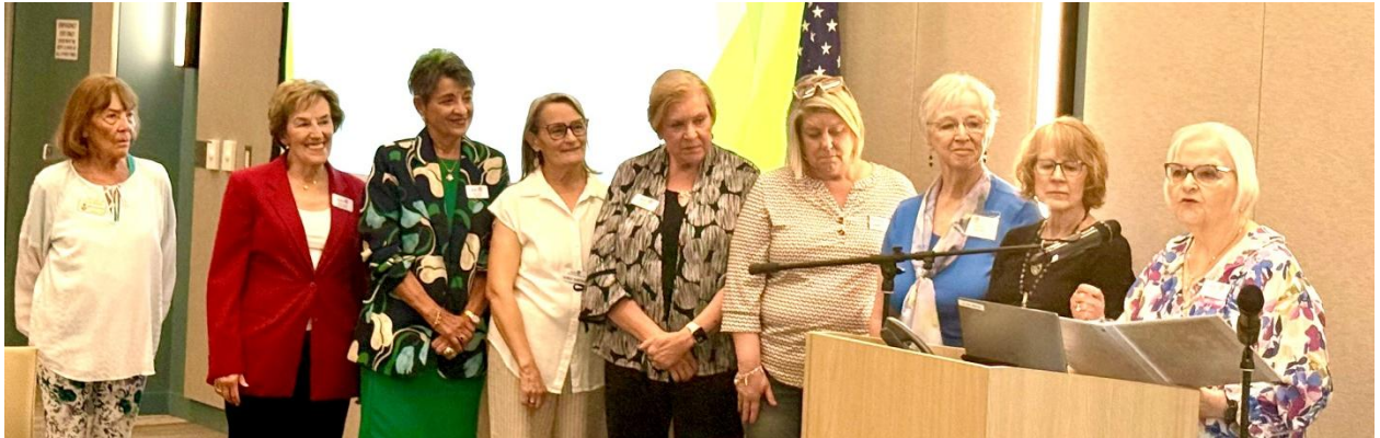
AZ Arizona Board – 2026-27