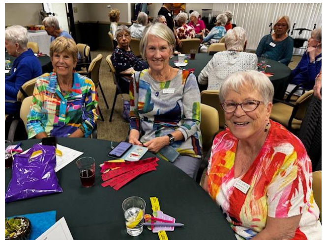
Spring Luncheon Fundraiser