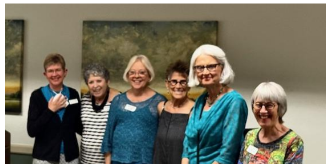
2026 - 2027 New Board Members